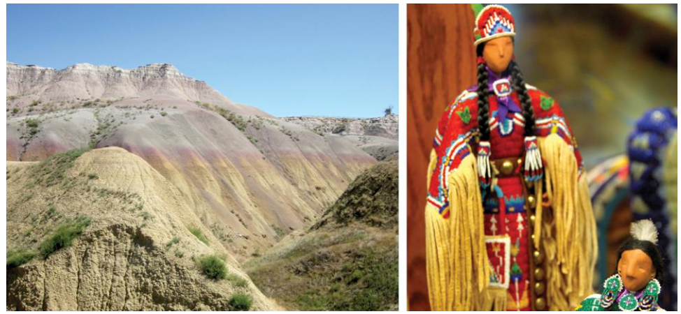
HIGHLIGHTS... 1880 Train, Mt. Rushmore, Black Hills Gold, Crazy Horse Memorial, Needle Highway, Custer State Park, Chuckwagon Supper, Hot Springs, Deadwood, Badlands National Park, Wall Drug Store

Day 1: Tuesday, May 27, 2014 Rapid City, South Dakota - Tour Begins Rapid City is the gateway to some of the most intriguing and beautiful attractions in America. Experience the authentic west when you visit the inspirational memorials of spectacular Mt. Rushmore and visionary Crazy Horse. Delight in the tranquility of the Black Hills, Badlands and Custer State Park. (D)