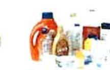
Plastic Bottles and Containers #1-7