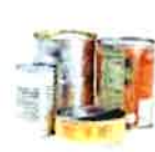
Tin or Steel Cans