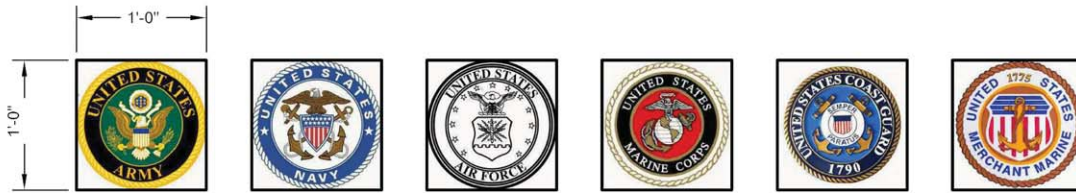
MILITARY BRANCH PLAQUES