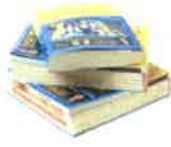
Phone Books Directorios