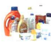
Plastic Bottles and Containers #1-7 Botellas de plástico y recipientes #1-7