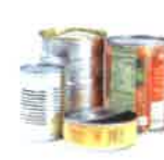
Tin or Steel Cans Latas de hojalata y acero