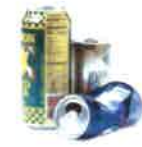
Aluminum Cans Latas de aluminio